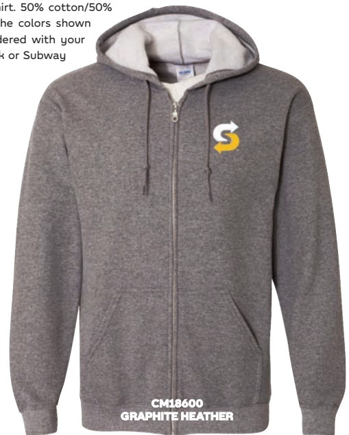
CM18600 GRAPHITE HEATHER