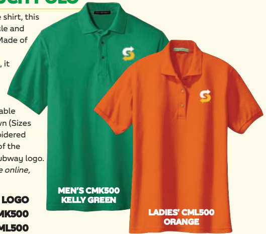
MEN'S CMK500 KELLY GREEN

A great, easy care shirt, this polo is both wrinkle and shrink resistant. Made of soft, supple, lightweight pique, it feels oh-so-good against your skin. 65% polyester/35% cotton. Available in the colors shown (Sizes XS-6X) and embroidered with your choice of the Choice Mark or Subway logo. Tall sizes available online, Style TLK500.