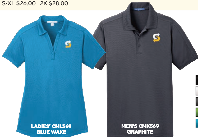
LADIES' CML569 BLUE WAKE