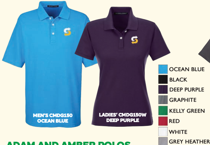
MEN'S CMDG150 OCEAN BLUE