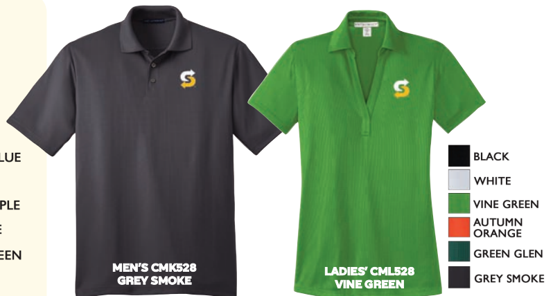
MEN'S CMK528 GREY SMOKE