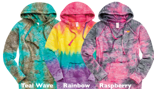
Teal Wave Rainbow Raspberry