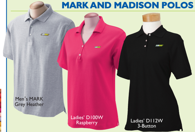
Men's MARK Grey Heather